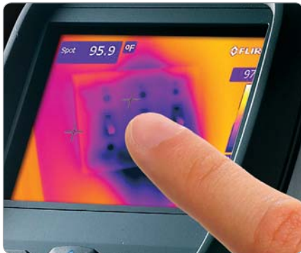
Add Up to 3 Moveable Measurement Spots Easily