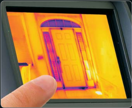
Large 3.5" Touchscreen Puts Fast Tools at Your Fingertips