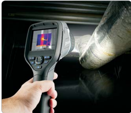
Spot LED Light for Dark Corners

Presenting the best performance and value in compact thermal imaging cameras ever, designed to fit beautifully into your IR inspection program, budget, and the palm of your hand.