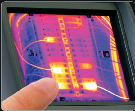
Large 3.5" Touchscreen Puts Fast Tools at Your Fingertips