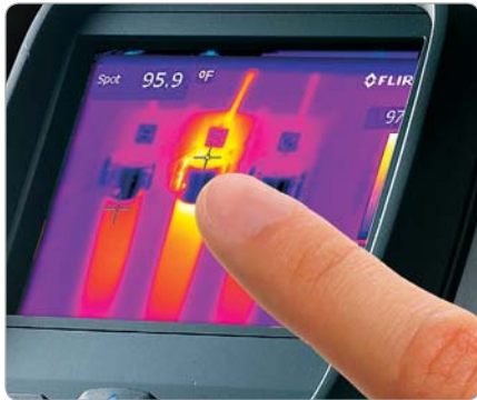
Add Up to 3 Moveable Measurement Spots Easily