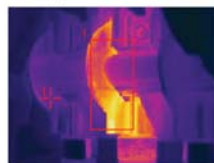
building 18 - electrical